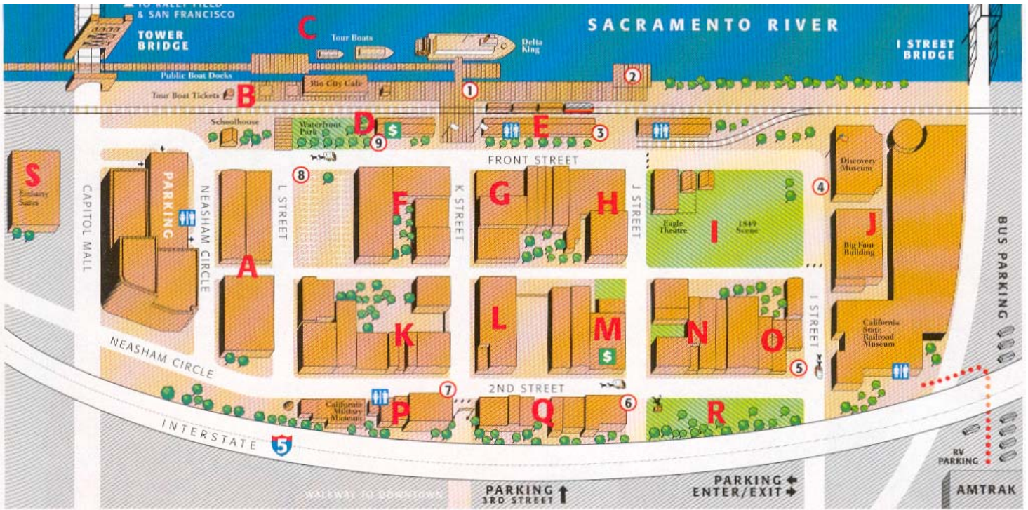
Map of "Old Sacramento"

Four Museums and numerous tourist sites are in "Old Sacramento"